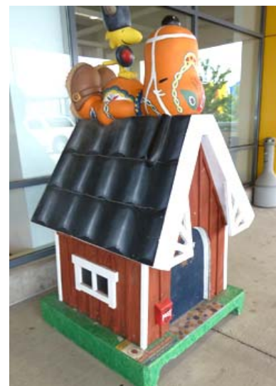
A little bit of Sweden in America. Snoopy and his dog house, Swedish style at IKEA, MN