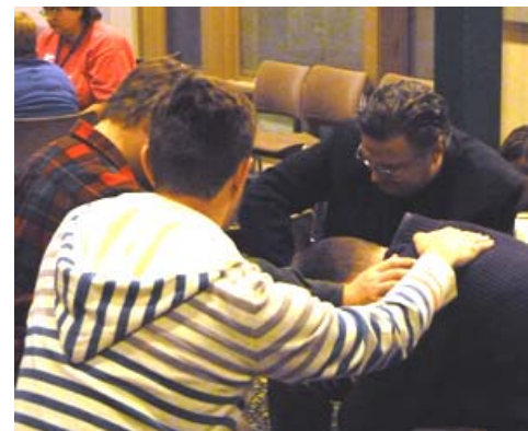
Practicing the 'Healing Presence Prayer'