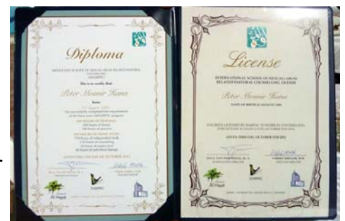
13 students graduated in Egypt, and they were the first to receive their diplomas and license. It was so great to see!

Many helping professionals don't know how to deal with those that come from a traumatic past, especially if it is sexual abuse. These schools are helping to train people to do just that! It is so beautiful to meet these students each year and hear the stories of what they are learning. The Egyptian school is a mix of Coptic Christians, Catholics, evangelicals and others.