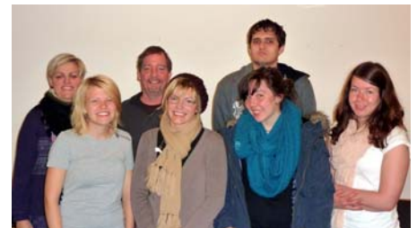
YWAM Svenborg, Denmark DTS school

In Denmark I taught in a small YWAM DTS on the island of Fyn about hearing God's voice and the Father's heart for them. They were hungry and ready for it. They are doing their outreach in Denmark first and then in Scotland, so I was the last teacher they had before taking off on their outreach. What a special group they were!